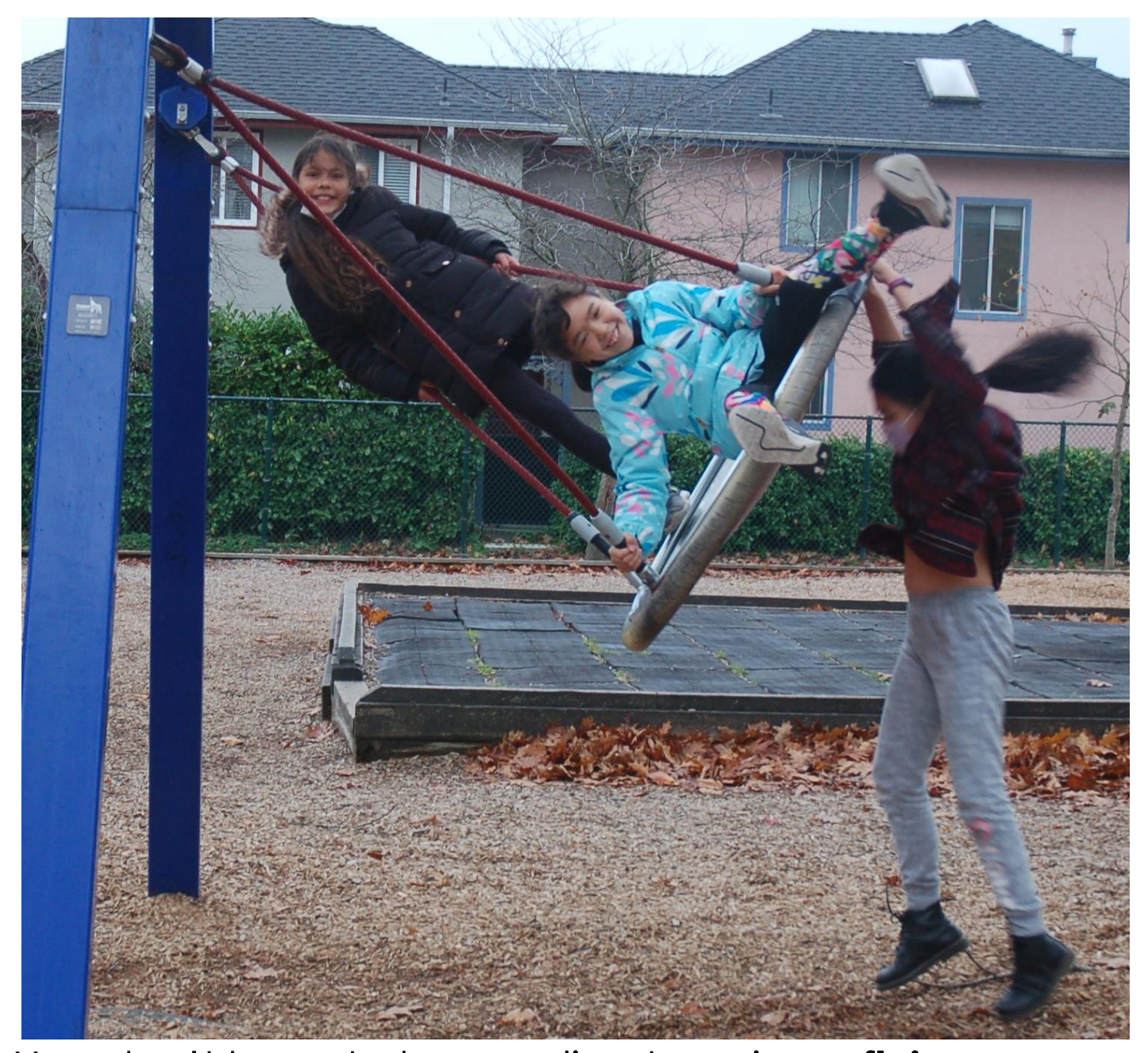
You don't have to be an alien to enjoy a flying saucer By Arabella ( Adventure Club )

It was fun riding on the swing with my friend. It was fast and high. I like it because some people can stand up and some can sit down.